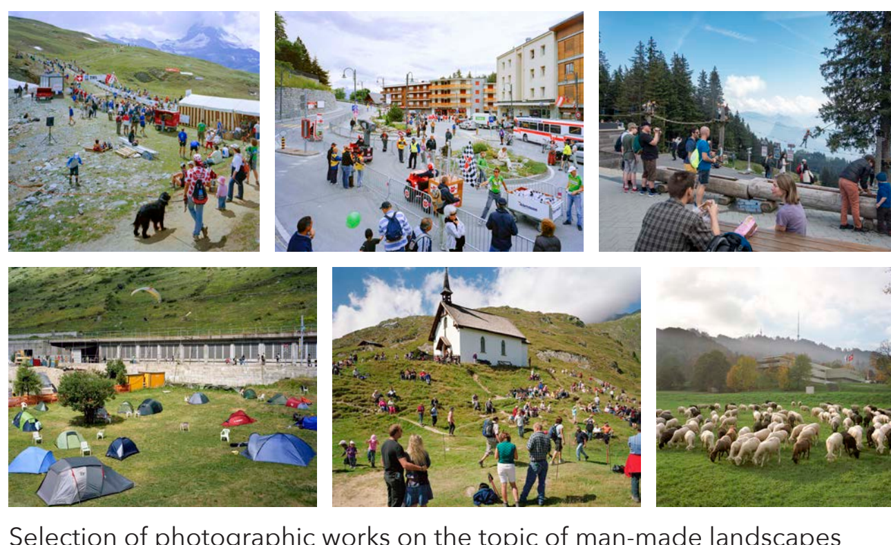
Selection of photographic works on the topic of man-made landscapes

The Biennale Talks will be the prelude for a series of activities about the matter of the public, that will take place back in Liechtenstein. A <u>public cross-faculty symposium</u> at the University, bringing together scholars from the fields of Architecture, Economy and Information Systems, will provide a holistic spectrum of research and opinions on future forms of public space. The exhibition from Venice will be shown in a local venue and offer the possibility for an eventual book launch of a publication summarizing all works and selected essays on the subject. Combining it with a more comprehensive exhibition of contemporary artworks on the relationship between humans and their environments could provide an ideal link to a broader audience. Following for instance the concept of the seminal exhibition, New Topographics: Photographs of a Man-Altered Landscape', curated by William Jenkins in 1975 could for example be initiated at the Art Museum of Liechtenstein.