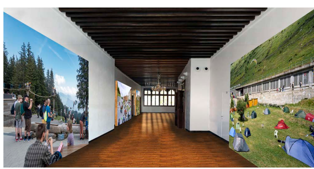
Event space with mounted light boxes at the Palazzo Trevisan degli Ulivi

During the summer semester 2018, students will produce emblematic showcase model sceneries of public spaces in the urban landscape, under the assistance of a professional model maker in the nominal scale H0 (1:87), that is typically used for model railways. By immersing into specific architectural situations, the spatial potential of the territory can thereby be researched and unfolded. The models will be cased in wooden boxes and later be shipped to Venice, where they will also serve as columns for the exhibition. Mounted on light boxes by Zumtobel that can be dissembled for transportation, a selection of five oversized photographs will be put on display and serve as an impressive visual background for the Biennale event of the Principality of Liechtenstein at the Palazzo Trevisan degli Ulivi.