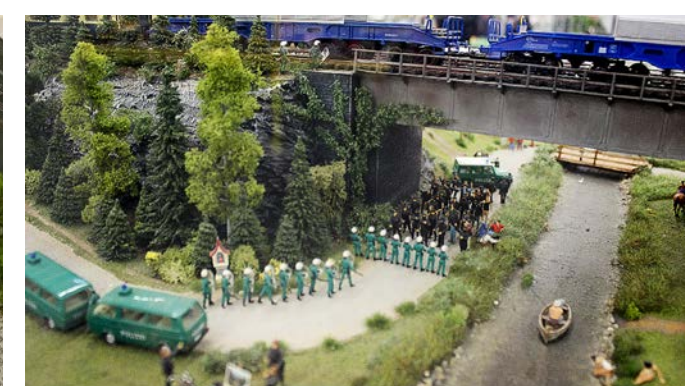
Constructing model sceneries of public spaces in urban landscapes

During the summer semester 2018, students will produce emblematic showcase model sceneries of public spaces in the urban landscape, under the assistance of a professional model maker in the nominal scale H0 (1:87), that is typically used for model railways. By immersing into specific architectural situations, the spatial potential of the territory can thereby be researched and unfolded. The models will be cased in wooden boxes and later be shipped to Venice, where they will also serve as columns for the exhibition. Mounted on light boxes by Zumtobel that can be dissembled for transportation, a selection of five oversized photographs will be put on display and serve as an impressive visual background for the Biennale event of the Principality of Liechtenstein at the Palazzo Trevisan degli Ulivi.